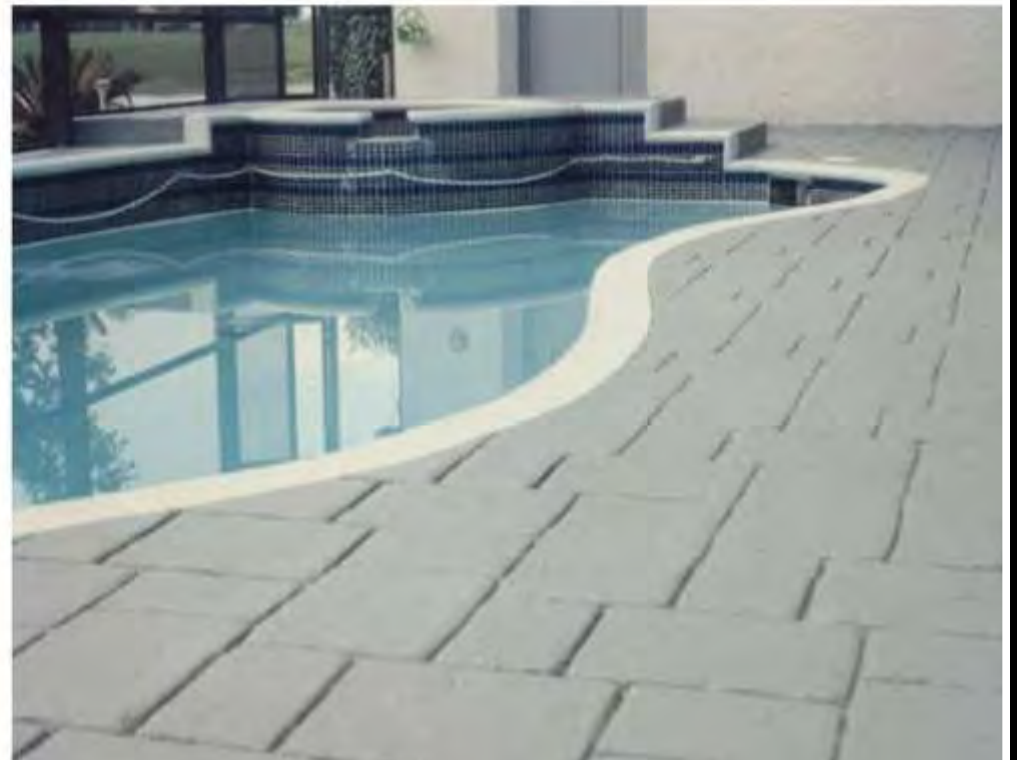
ASHLER SLATE DESIGN