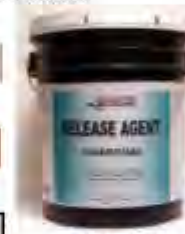
30 Pound Pail