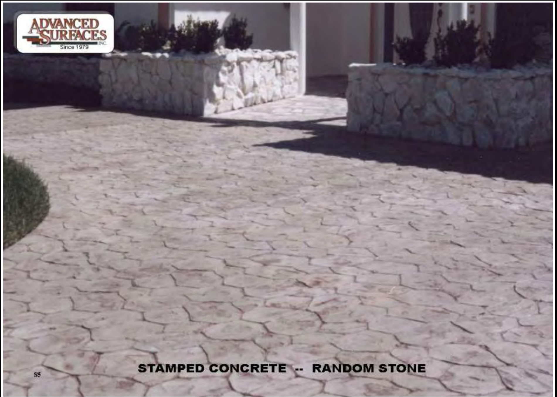
STAMPED CONCRETE -- RANDOM STONE