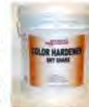
60 Pound Pail