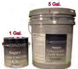
Super Concentrated Resin