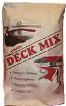
Deck Mix - 50 lbs. 16 colors available Catalog Page A-1

You are now ready to apply the final three coats of URO sealer. Coverage: 150 to 200 sq. ft. per gallon. Allow each coat to dry. If a slip resistant finish is desired, add a quart of Advanced Skid Guard to one 5 gallon of sealer. Apply the last two coats of sealer with the Skid Guard additive. Allow to dry: 2 to 3 hours for foot traffic and 72 hours for vehicular traffic.