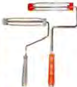
Roller Frame Catalog Page N-9