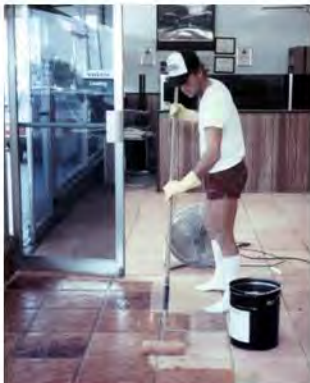
Seal 1st coat of URO Sealer