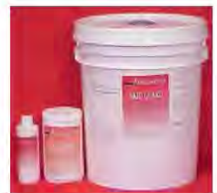
Skid Guard 3.2 oz. - 1 qt. - 5 gal. Catalog Page E-1