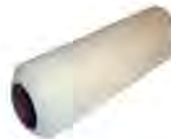
Roller Cover Catalog Page N-9