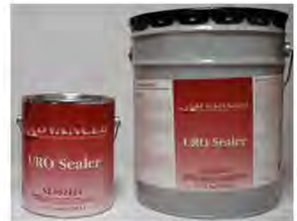
Advanced URO Sealer Catalog Page D-8