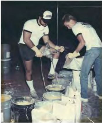
Mixing Advanced Deck Mix & Resin