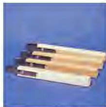
URO Cutting Tool 1/4", 3/8", 1/2", 3/4" Catalog Page N-16