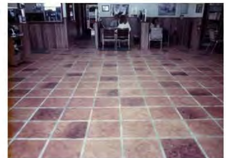
Apply final coats of sealer