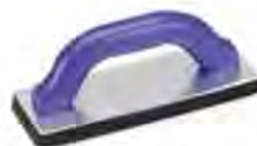
Grout Float Catalog Page O-4