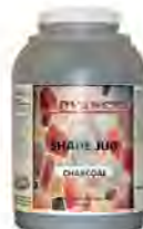
URO Shade Jug 25 Shade Colors Catalog Page F-1