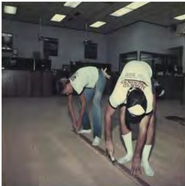
Cut the design