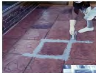
Grout all areas and clean thoroughly