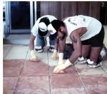
Shade URO surface desired shades