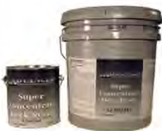
URO Super Concentrated Deck Resin Catalog Page B-1